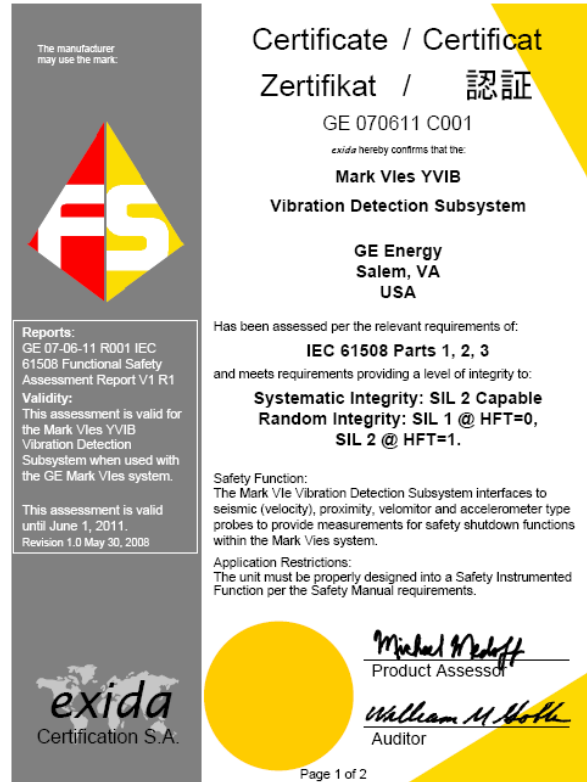
Figure 6: exida IEC 61508 Certificate

When the audit is complete and the independent auditor supports the certification, the certificate (Figure 6) is issued.